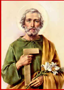
Our Patron Saint St. Joseph

Now that the 90 th Anniversary is over, we can get back to the book. As of the submission date for this article, we have 465 pages finished with about 285 to go. The word count has reached about 135,000.