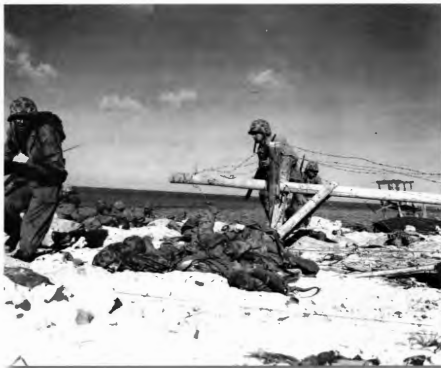
Marines landing on Tarawa 20-21 November 1943.