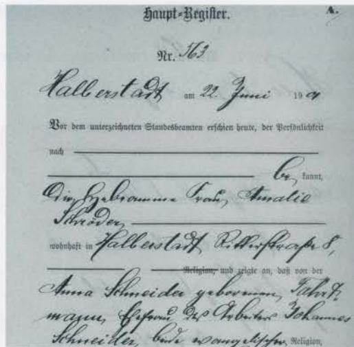
Birth register from 1901 in Halberstadt, Sachsen, Preußen