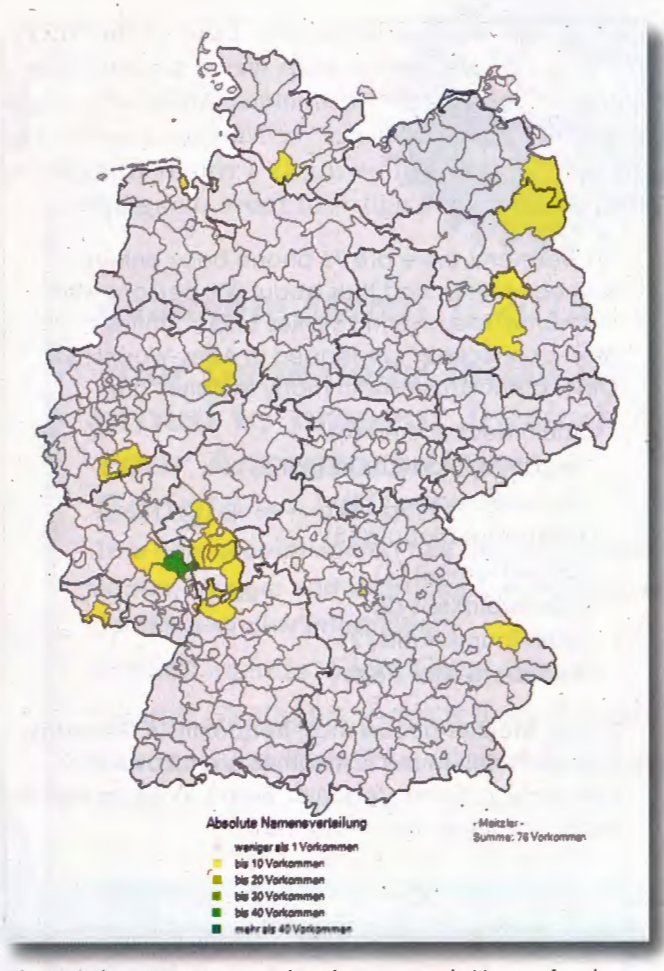
The Meitzler surname mapped at the ancestry de Namensforschung. (Ancestry de)

The outline map is colorized with shades running from a light grey to pink to yellow to several darkening shades of green, dependent on the number of entries for a surname found in that kreis, or "district or county" as we would call it in