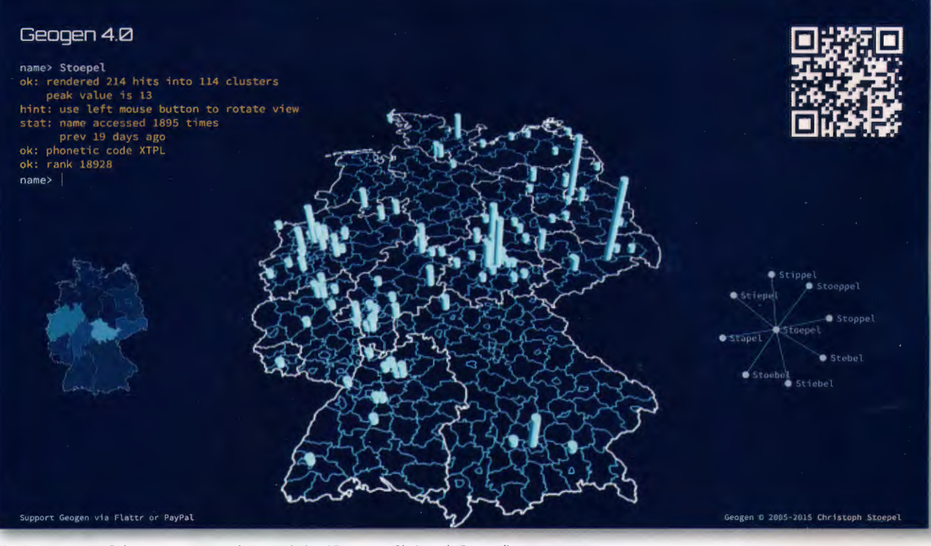
The home page of the geogen.stoepel.net website